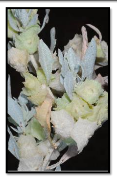
Prosopsis glandulosa var glandulosa